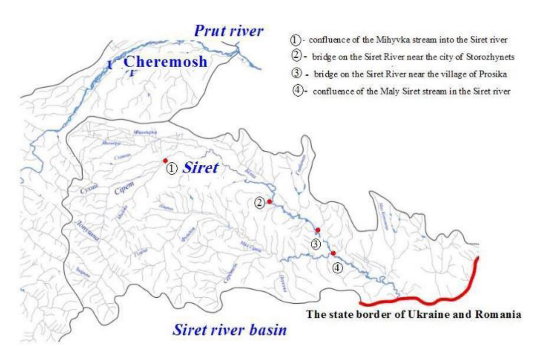
Figure 1. Map of sampling on the Siret River

For the ecological evaluation of the water quality of the Siret River, the Woodiwiss index or the Trent River Index (TBI) was used, which is one of the most common indices used in the EU and other countries, except for some changes in the worksheets for calculating the index (Lyashenko and Zorina-Sakharova, 2012). The TBI assessment is based on a working scale that uses the sequence of disappearance of widespread macroinvertebrate benthic communities in accordance with water and sediment pollution, i.e. the ratio of taxa that are sensitive and insensitive to external factors. The results of the assessment are given in points from 0 to 10 (Afanasyev, Grodzynskyi, 2004). We also used the Biological Monitoring Working Party Index (BMWP), which was developed by the Institute of Freshwater Ecology